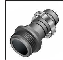
Insert Fittings w/Clamps