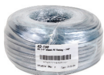
XQ-100 100 foot coil