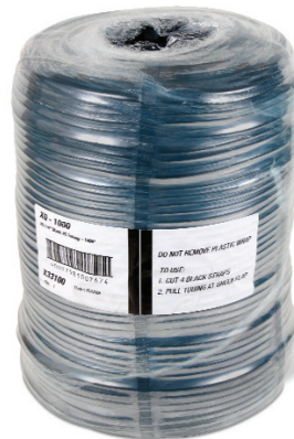
XQ-1000 1,000 foot coil