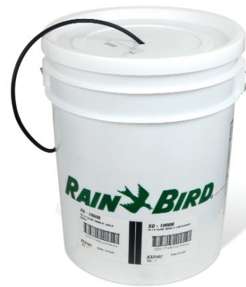
XQ-1000B contains 1,000' coil