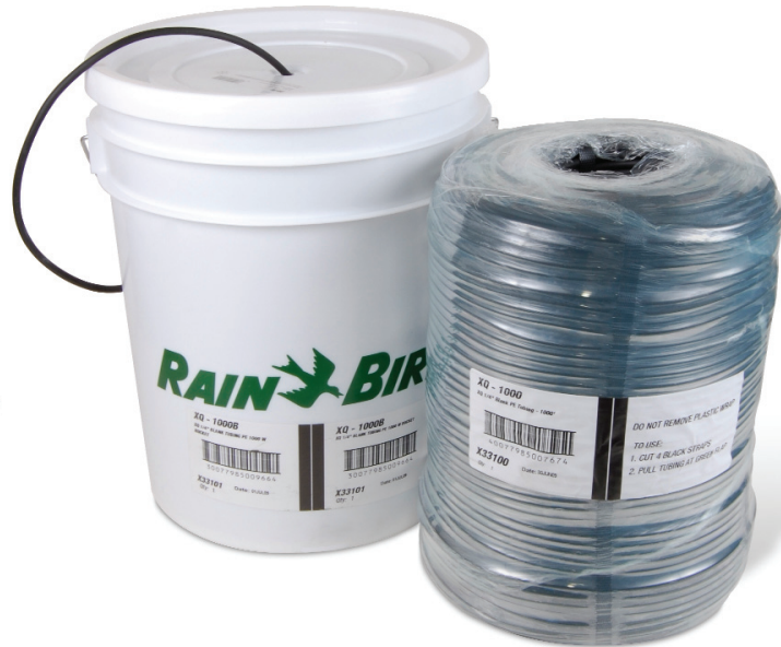
"Ours" 1,000' in a XQ Bucket™ (patent pending)