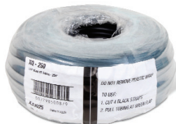
XQ-250 250 foot coil