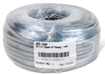
XQ-100 100 foot coil