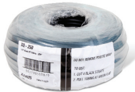
XQ-250 250 foot coil