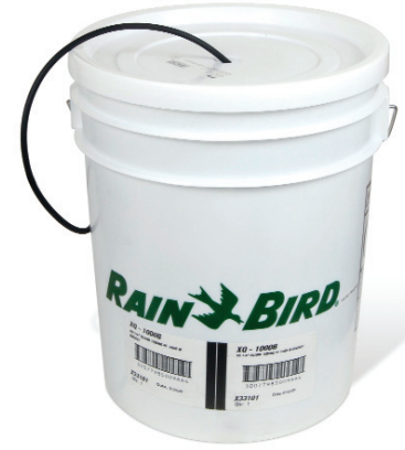
XQ-1000B contains 1,000' coil