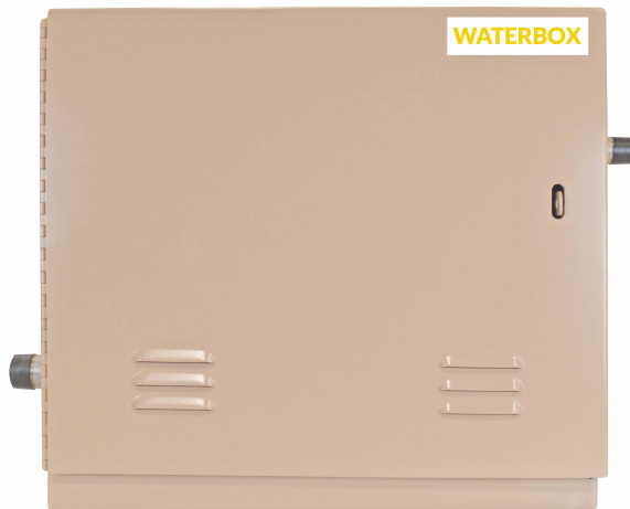
WaterBox Model S Pumping System

Why choose The WaterBox Model S Pumping System?