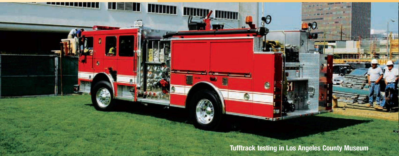
Tufftrack testing in Los Angeles County Museum

Tufftrack produces an aesthetically superior alternative to hard surface pavements, with the benefits of an environmentally sound solution. Tufftrack reduces storm water runoff and allows moisture to filter naturally through the soil, reducing ground water contamination and eliminating the need for large drainage systems. The heat absorption and light reflectivity of an area using Tufftrack are great benefits to the surrounding vegetation and buildings.