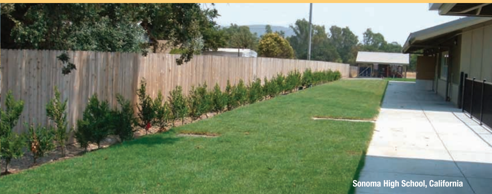
Sonoma High School, California