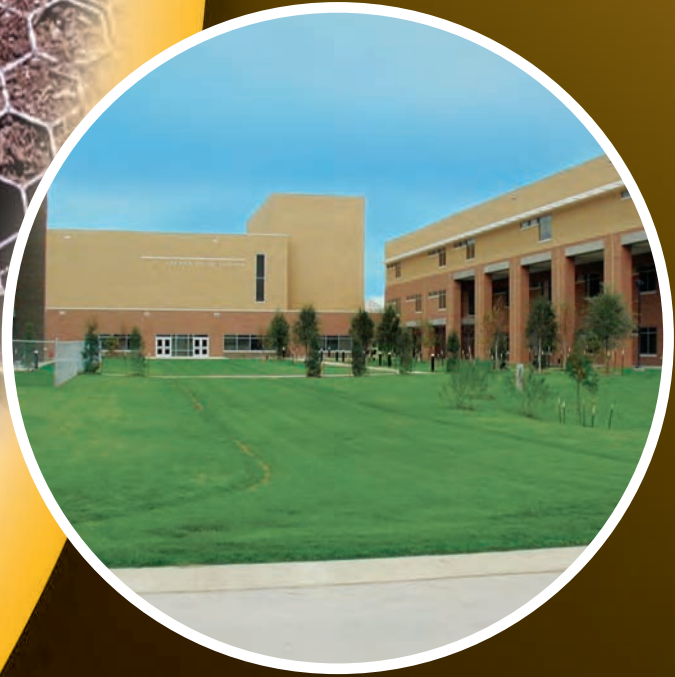
Brewer High School before and after Tufftrack™ Installation