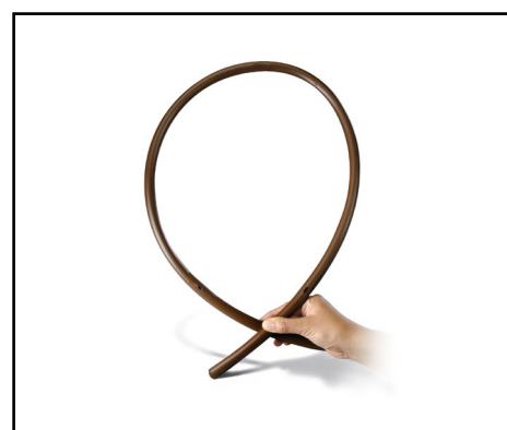
XFD Dripline offers increased flexibility for easy installation

XFDP = Purple to indicate models that use non-potable water