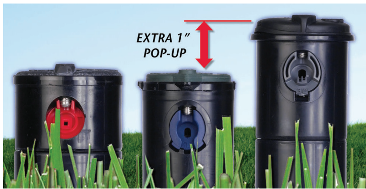
The T5 Series delivers an extra inch of pop-up.