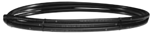
Super Funny Pipe

This unique piping acts like an extension cord, allowing you to put sprinklers exactly where you want them. Even deep-seated high-pops are easy to install in difficult, hard-to-trench locations.