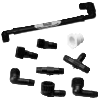
Super Funny Pipe Fittings