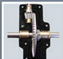
Fully Enclosed Metal Gears with Zerk Fittings