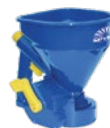
HHS100 Calibrated Handheld Spreader