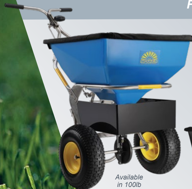
Available in 100lb