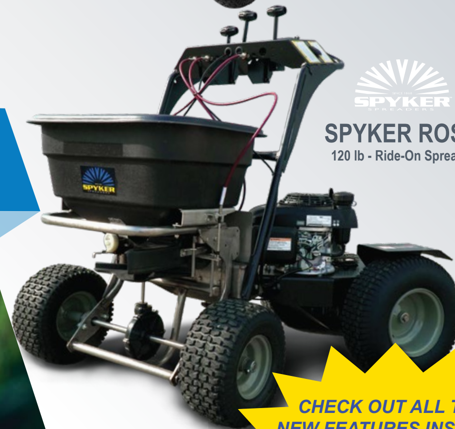
SPYKER ROS 5 120 lb - Ride-On Spreader