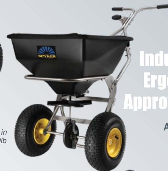
Available in 80lb & 50lb

New Hi-Visibility Ice Melt Spreader with a Stainless Steel Carving Blade