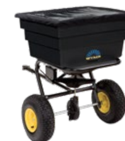
P30-17520 175 lb - Tow Spreader