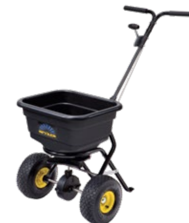
P20-5010 50 lb - Light Duty Push Spreader