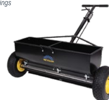
P70-12010 120 lb - Working Width Drop Spreader