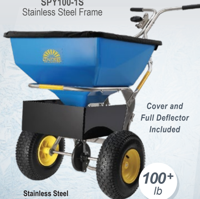
SPY100-1S Stainless Steel Frame