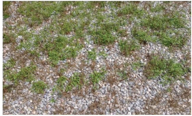
Glyphosate 0.73 fl. oz./1,000 sq. ft. Bayer, Clayton, NC, 2012, HE12NARDS3