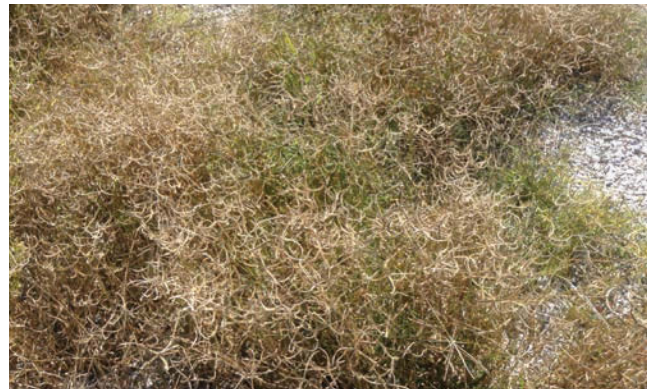
Glyphosate 0.73 fl. oz./1,000 sq. ft. Bayer, Clayton, NC, 2012, HE12NARDS3