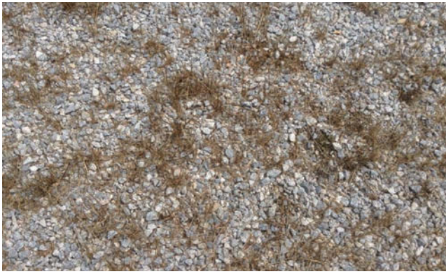
Specticle Total 16 fl. oz./1,000 sq. ft. Bayer, Clayton, NC, 2012, HE12NARDS3