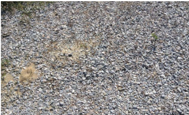
Specticle Total 16 fl. oz./1,000 sq. ft. Bayer, Clayton, NC, 2012, HE12NARDS3