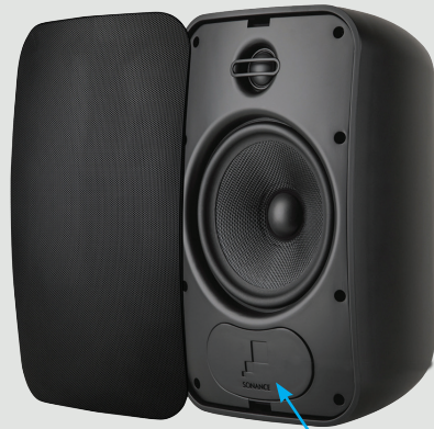
FRONT-MOUNTED TERMINAL CONNECTION