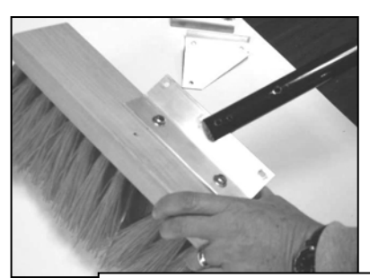
Shown with aluminum handle