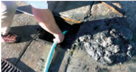
Great for cleaning under sidewalks or cart paths