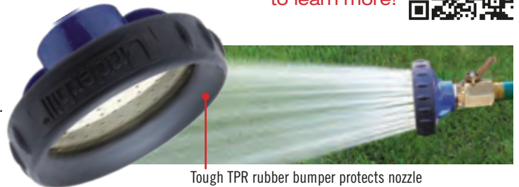
Tough TPR rubber bumper protects nozzle