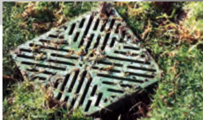
Ideal for 4"-6" drains and catch basins

Wire attachment connector for mapping drain location under greens, bunkers and other locations using a wire locator.