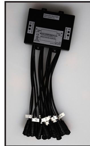
Minleon-Rainmin's RGB+ NDB16 network data & power distribution box.

Specifications as of May 2018 and are subject to change.