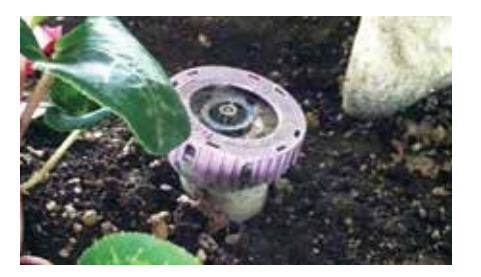
Clunky clip-on alternative

The patented purple cap includes the international Do Not Drink symbol and warnings in English and Spanish, so you don't have to worry about clip-on warning caps.