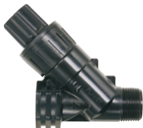
3/4" HIGH FLOW