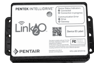
VFD-LINK WIRELESS TRANSLATOR FOR INTELLIDRIVE