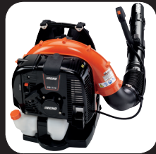
Tube-mounted throttle with cruise control (PB-770T)

The vented back pad design allows air to circulate around the user for comfortable operation in hot weather.