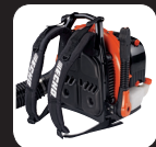
Padded back rest and shoulder straps