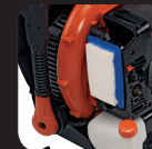
Side-mounted, heavy-duty, dual-stage air filtration