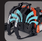
ECHO-exclusive vented back pad allows air to circulate around the user.