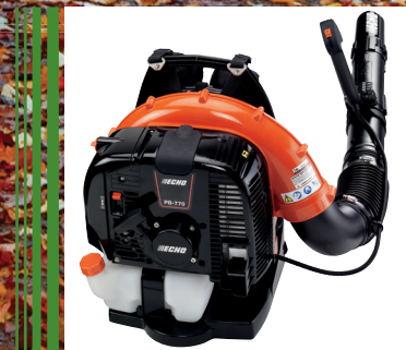
Tube-mounted throttle with cruise control (PB-770T)

5 year* consumer, 2 year commercial and 90 day rental warranty *Visit www.echo-usa.com/5year to learn more.