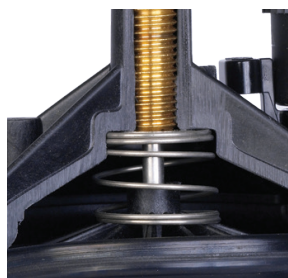
Self-Cleaning Metering Pin A self-cleaning feature that operates two times during every valve cycle ensuring smooth positive opening and closing.

Provides superior performance and extended life without tearing in high-pressure golf applications.