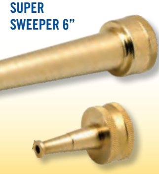
SWEEPER JR. 2"