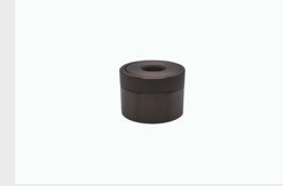
LAB-077 Macro Quick Connect Junction Box Brass