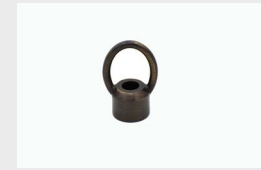
LAB-035 Micro Light Mounting, Hanging Mount