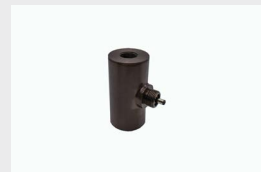
LAB-102 Micro, Quick Connect Bollard T-Mount