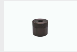
LAB-076 Micro, Quick Connect Junction Box