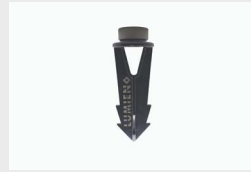
LAP-006 8" Spike with Quick Connect