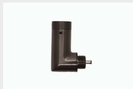
LAB-083 Nano, Quick Connect L-Mount