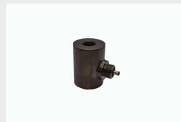
LAB-101 Micro, Quick Connect Bollard L-Mount