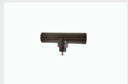
LAB-084 Nano, Quick Connect T-Mount