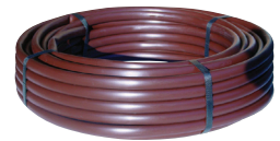
Techline CV Dripline TLCV

Start rows of Techline CV 2" from hardscapes and 4" from softscapes.