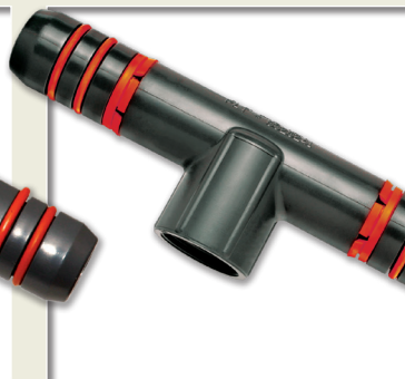
KwikConnect™ Reducing Tee 1" 1" X 1" X 1/2" FPT 1" X 1" X 3/4" FPT