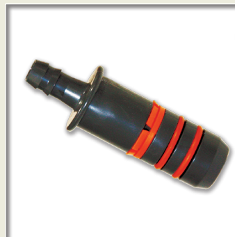
KwikConnect™ End of Line 1"