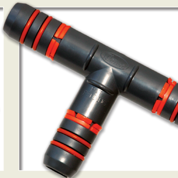
KwikConnect™ Tee 1"