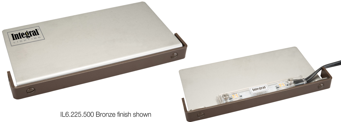
IL6.225.500 Bronze finish shown