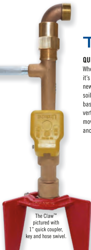
The Claw™ pictured with 1" quick coupler, key and hose swivel.