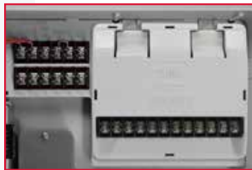
16-station configuration with (1) 12-station module