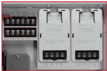
12-station configuration with (2) 4-station modules