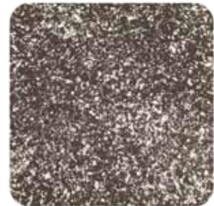
1000 lbs per acre