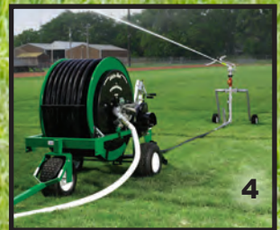
4 Turn On Water To Begin Operation

Machine Will Operate Unattended Turning Off Automatically At The End Of Its Run