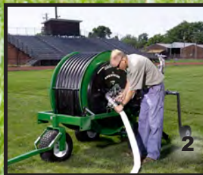
2 Attach Water Source