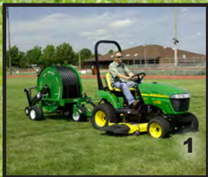
1 Pull Water-Reel Into Position