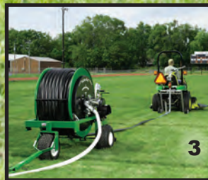
3 Pull Out Sprinkler Cart