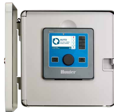
Metal Wall Mount (gray or stainless)

▶ = Advanced Feature descriptions on page 89