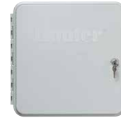
Plastic Wall Mount