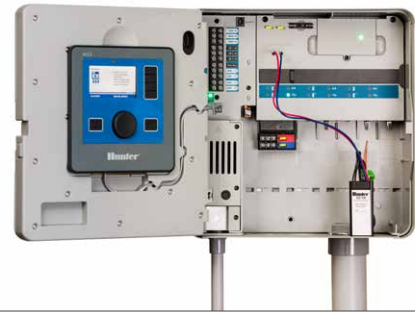
Metal Wall Mount (gray or stainless)