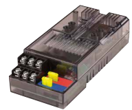
A2C-D75 Expansion Module

Expand any ACC2 Decoder controller in 75-station increments, up to 225 stations.