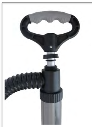
O-Ring in Top Cap Figure 2-1

If you encounter water seeping between the aluminum shaft and the top threaded portion of the hand pump, it could time to replace the O-Ring. See Figure 2-1.