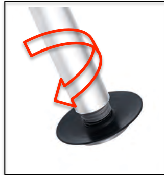
Plunger Wiper Seal Figure 3-1

If the hand-pump starts to loose suction even after a thorough cleaning check the cylinder plunger, see figure 3-1. Replace if needed. Lastly before threading the bottom cap onto the cylinder, verify the flapper-valve is flat and is not curled.