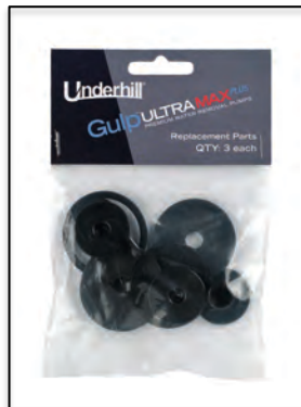
Gulp UltraMax Plus Replacement Parts P/N A-GRPP Figure 3-2