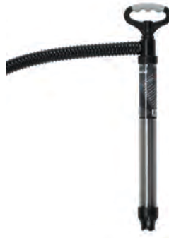
Gulp UltraMax Plus 21" Length