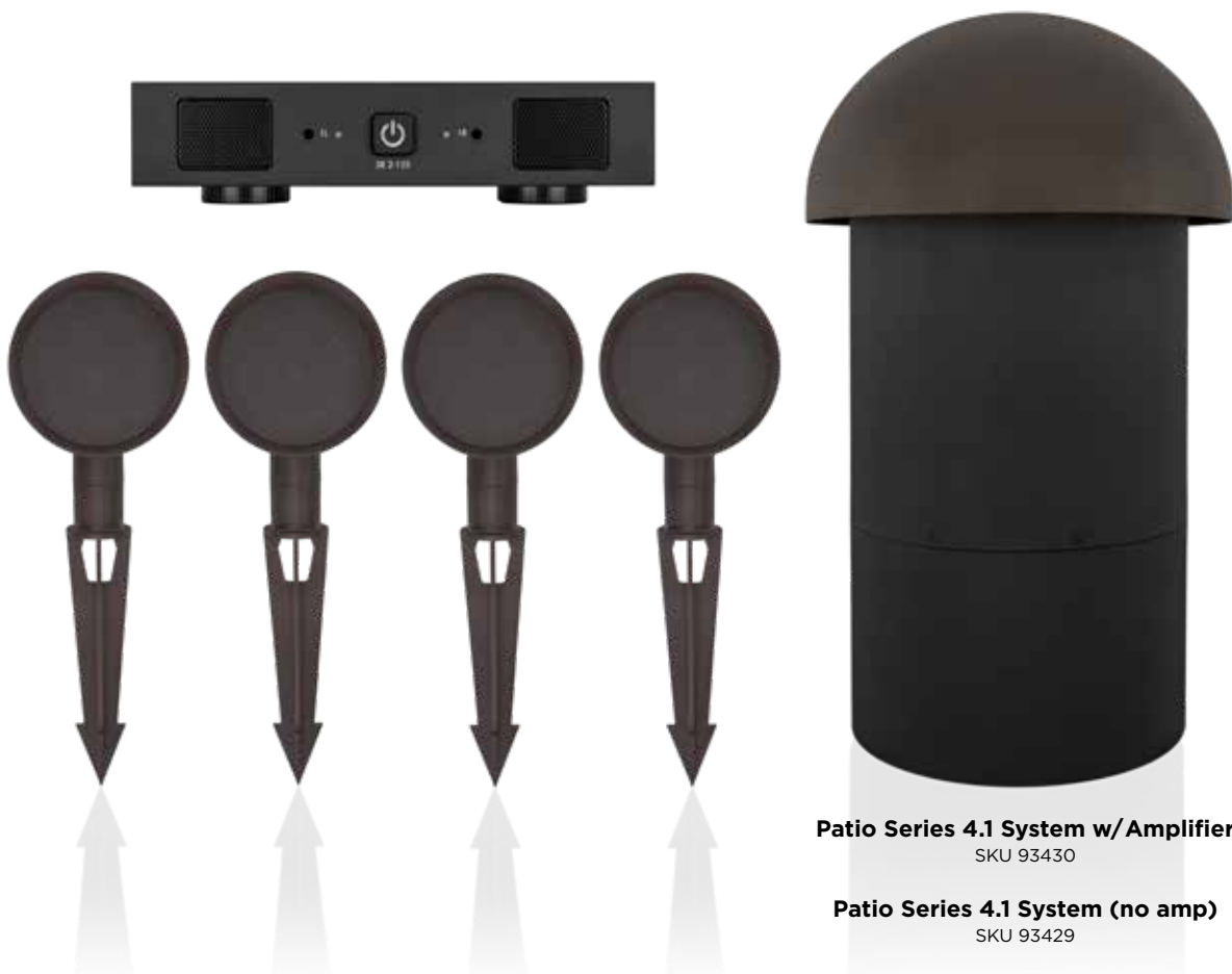
Patio Series 4.1 System w/ Amplifier SKU 93430

4 SATELLITES | 4 GROUND STAKES | 1 SUBWOOFER | 1 SR 2-125 AMPLIFIER*