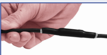
Small ACE Connector installation