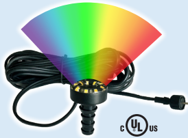
LED Color-Changing Fountain Light

NOTE: Requires Color-Changing Lighting Control Hub and standard 12-volt transformer