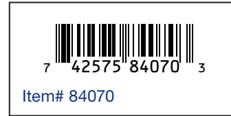
25' 5-Outlet Color-Changing Lighting Extension Cable