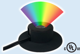
2-Watt LED Color-Changing Waterfall and Up Light