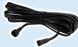
25' Color-Changing Lighting Extension Cable