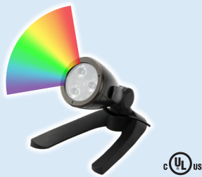
4.5-Watt LED Color-Changing Spotlight