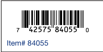
LED Color-Changing Fountain Light Kit