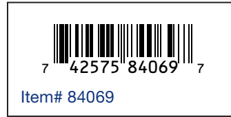
25' Color-Changing Lighting Extension Cable