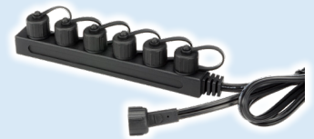
6-Way Color-Changing Splitter