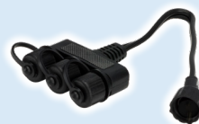
3-Way Color-Changing Splitter