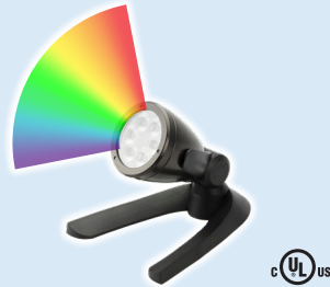
8-Watt LED Color-Changing Spotlight