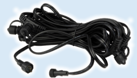
25' 5-Outlet Color-Changing Lighting Extension Cable