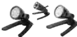
B Garden and Pond Spotlight