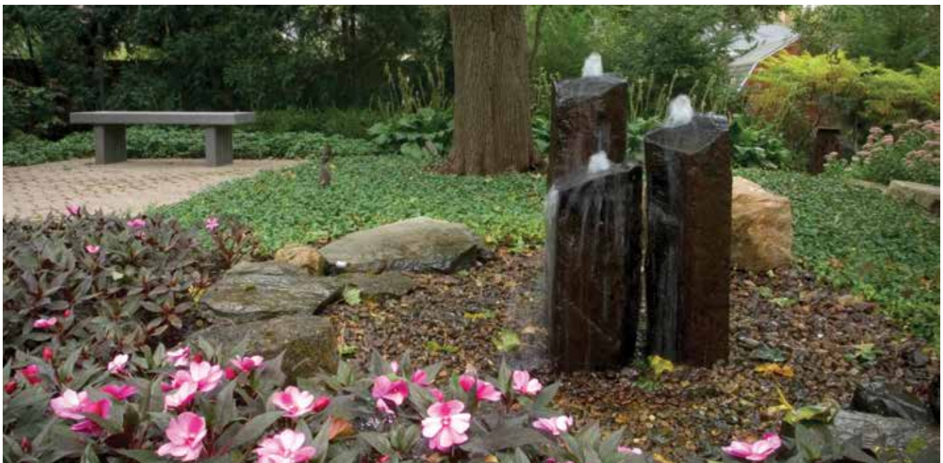
AquaBasin ® 45