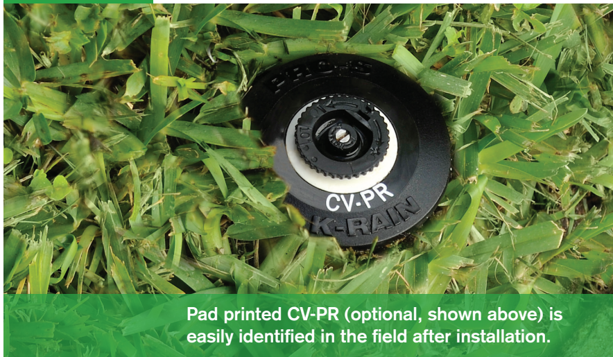
Pad printed CV-PR (optional, shown above) is easily identified in the field after installation.