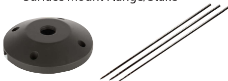
Surface Mount Flange/Stake

Includes three 7 inch threaded stainless steel stabilizing pins for ground mounting or surface mounts with four screws or over a junction box