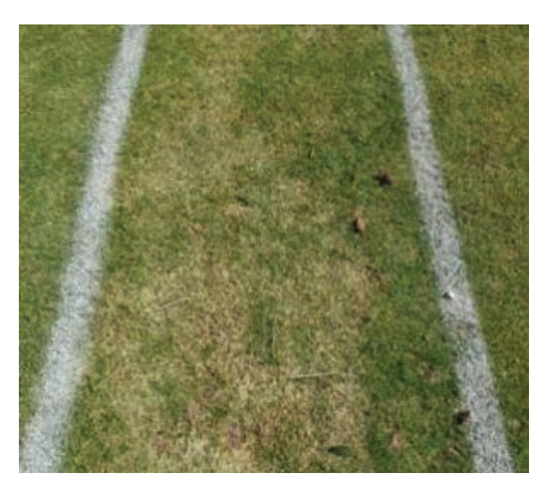
Interface® fungicide 4.0 fl. oz. + Triton® FLO fungicide 0.55 fl. oz. / 1,000 ft²