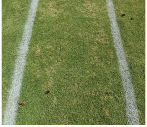
Contend 1 fl. oz. Contend A + 2.6 fl. oz. Contend B / 1,000 ft<sup>2</sup>