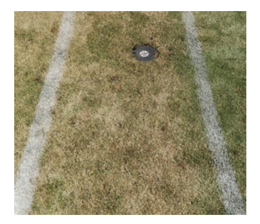
Untreated Check Primary pathogen: T. ishikariensis Gray snow mold, 120 days snow cover