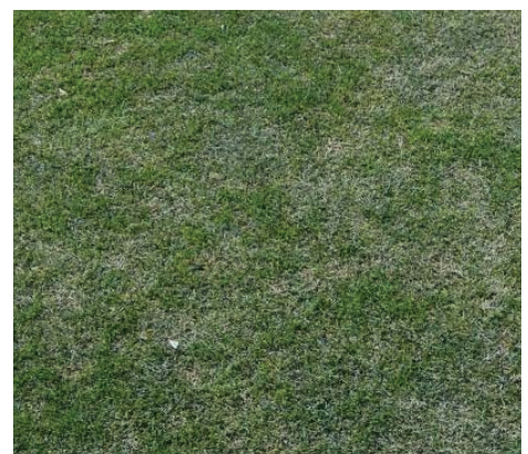
Contend A 1 fl. oz. + Contend B 2.6 fl. oz. / 1,000 ft<sup>2</sup>