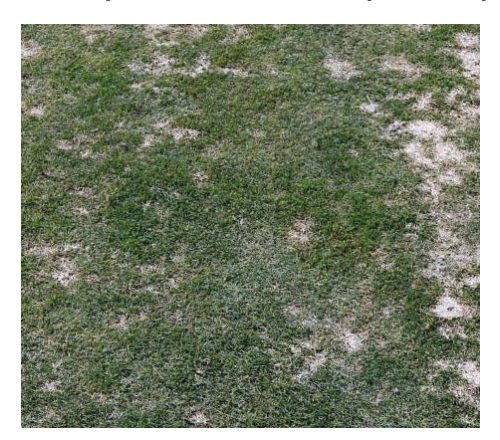
Concert® II fungicide 8.3 oz. + Banner Maxx® fungicide 1 oz. / 1,000 ft²

Professional Turfgrass Solutions, A. Van Dyke, Park City, UT 150 Days Snow Cover, Fairway Kentucky Bluegrass, Poa annua