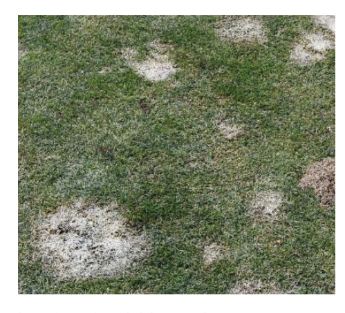
Interface fungicide 4.0 fl. oz. + Mirage^{\circ} fungicide 1.4 fl. oz. / 1,000 ft<sup>2</sup>

Contact your local Syngenta Territory Manager online at GreenCastOnline.com/ContactUs.