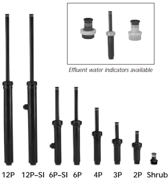
Effluent water indicators available

Featuring a low-pressure seal that flushes only upon retraction, 570Z models are ideal for small garden and turf areas. Seven distinct pop-up sprinkler bodies and a host of interchangeable nozzles provide unlimited design flexibility.