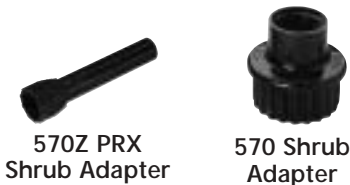
570Z PRX Shrub Adapter

For use with any 570 MPR Plus spray, stream bubbler or Maxijet® nozzle to effectively irrigate small shrubs and planters in non-traffic areas. Accepts all Toro nozzles and filter screens, and installs onto a 13mm (1/2") NPT riser.