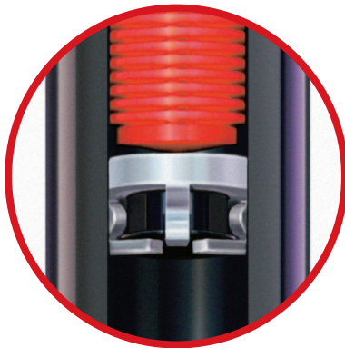
Patented X-Flow® Shut-off Device

Up to 40 gallons of water per minute can escape through a spray head that has a missing or damaged nozzle. This wasted water can lead to landscape erosion, property damage, or unsafe conditions due to wet hardscapes. The patented X-Flow device is factory-installed in the riser and holds back over 99% of the water that would otherwise be wasted in cases where the nozzle has been compromised through unintentional accidents or vandalism. Furthermore, X-Flow Technology allows for spray head maintenance or component replacement without the need to turn off the system.