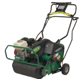
Lawnaire V with EST