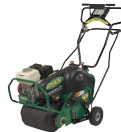
Lawnaire IV with EST

Lawnaire with EST available in 19" (IV) and 26" (V) models with choice of Honda® or Briggs & Stratton® engines.