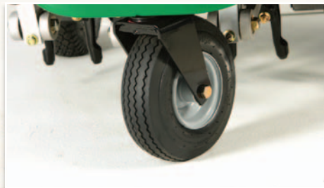
A unique front caster wheel allows the machine to maneuver with near zero-turn capability.

Specifications subject to change without notice.