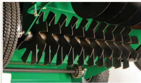
Durable cutting blades can be adjusted down to a depth of 1½”.