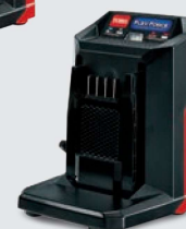
60V Max* Rapid Charger (5.4 Amp) Model 88605 » Charges up to 2.5x faster than the 2 amp charger due to a fan-cooled design that regulates temperature for max charge speed