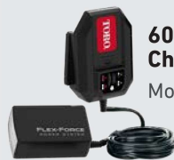
60V Max* Charger (1 Amp) Model 88610

Designed to monitor battery health, maximize lifespan, and optimize charging speed for each battery. Tabletop and wall mounted options available.