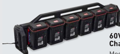
60V Max* 6-Pod Charger (12 Amp) Model 66550