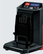
60V Max* Charger (2 Amp) Model 88602