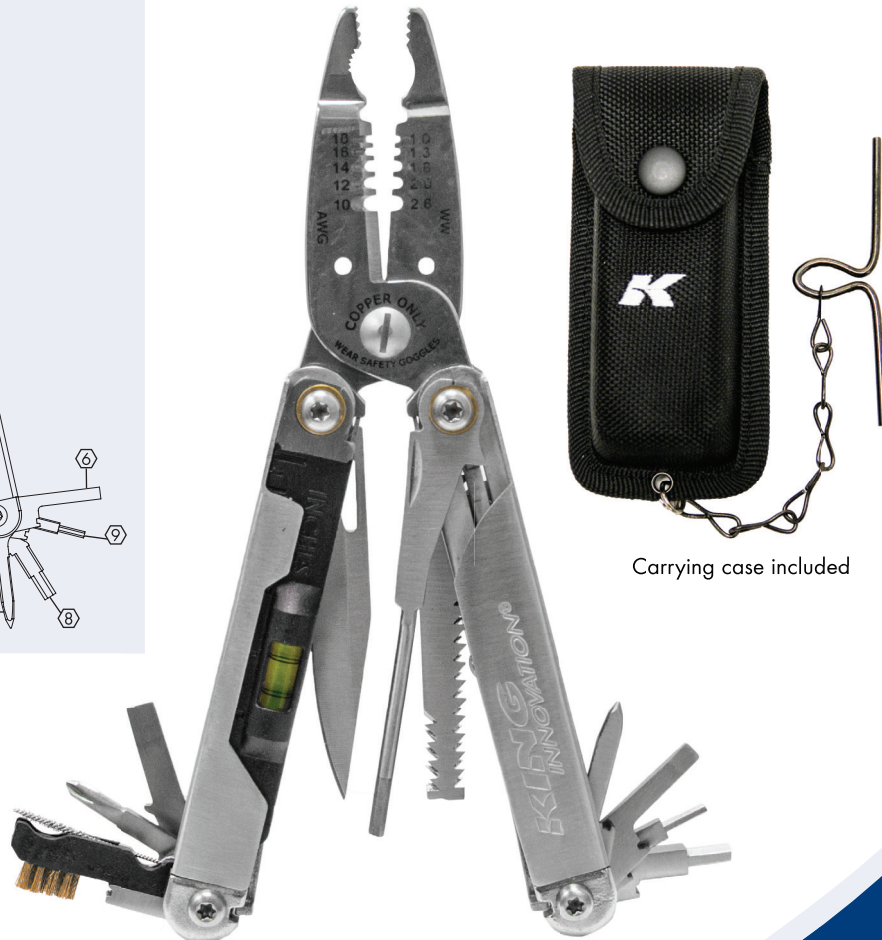
Carrying case included