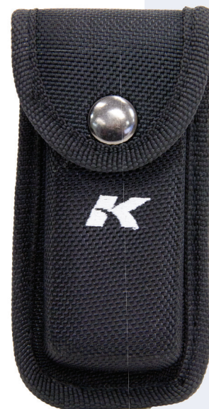
Carrying case included