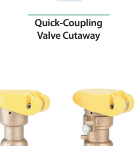
3-RC, 5-RC, 5-LRC