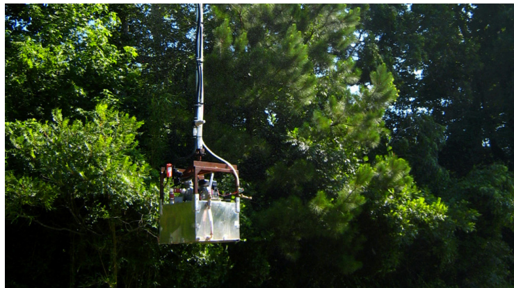
Aerial applications allow the option to use the full boom width to treat the right-of-way and side trim at the same time or to use a narrow spray pattern to perform a chemical side trim only.

There are many methods for growing-season foliar chemical side trim applications, but the most common are truck-mounted manifold sprayers; handgun application either from the ground, a truck or a bucket truck (lift truck); or aerial application from helicopters, usually on utility rights-of-way. See the Equipment section for suggested rates and spray volumes.