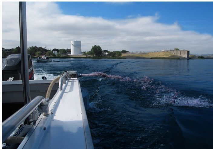
Figure 1. For use in: slow moving or quiescent bodies of water, including golf course, ornamental, fish and fire ponds; fresh water lakes, fish hatcheries and potable water reservoirs.